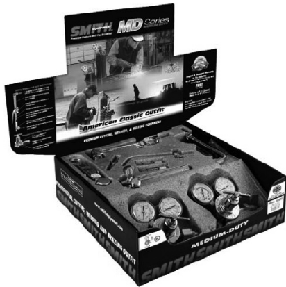
Display Carton Outfits