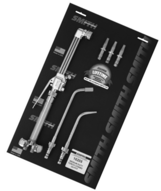
Torch Combo Kits