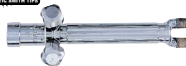
AW1A Length 5-3/4" (146mm) Weight 6-1/8 oz. (.17kg) Handle Diameter 11/16" (17mm) AW1A Valve Assembly Replacement AW11A