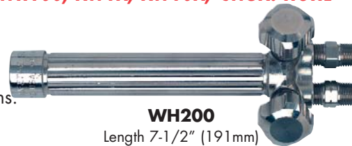
WH200 Length 7-1/2" (191mm) Weight 17-3/8 oz. (.46kg) Handle Diameter 1" (25.4mm)

USED WITH: Cutting Attachments - SC209, SC200, SC205, SC509 & DG205, DG209, DG200. Welding Tips - SW200 & 400 Series. Heating Tips - ST600 & ST800 Series.