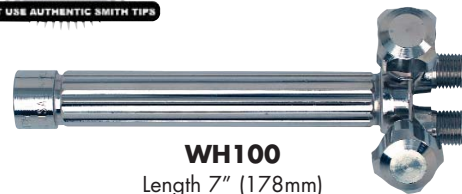
WH100 Length 7" (178mm) Weight 14 oz. (.39kg) Handle Diameter 15/16" (24mm)

USED WITH: Cutting Attachments - MC505, MC509 & DG105, DG109A. Welding Tips - MW200 & MW400 Series. Heating Tips - MT600 & MT800 Series.