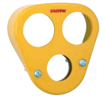
H195 "Hard Hat"™ Gauge/Regulator Guards see page 70