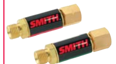
Flashback Arrestors see page 67