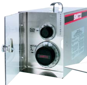
2 Gas 10-180 SCFH/5-85 LPM

The standard 2-gas series provides flows up to 180 SCFH and is suitable for most applications. The high capacity two-gas series provides flows up to 700 SCFH and is designed primarily for large manifold systems with station flowmeters in the welding industry. It is ideal for other industrial applications requiring high flow rates. The standard three-gas series provides flows up to 180 SCFH.