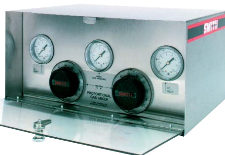
2 Gas 20-700 SCFH/9-330 LPM