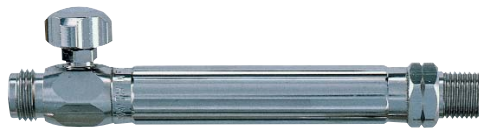
NE180A Length 5 3/8" (130mm) Weight 8 1/4 oz.