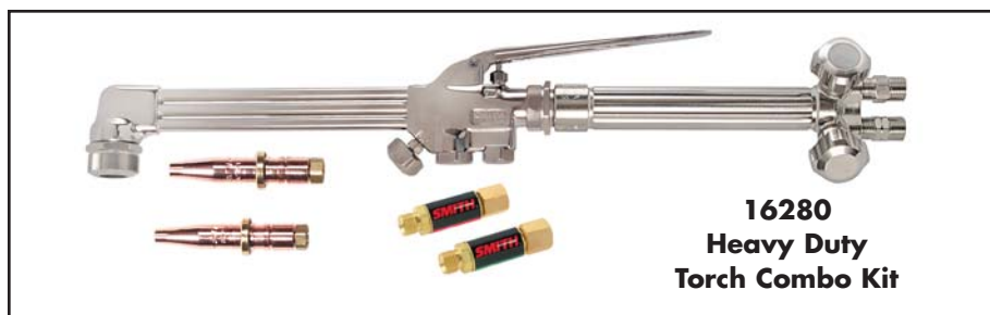
16280 Heavy Duty Torch Combo Kit