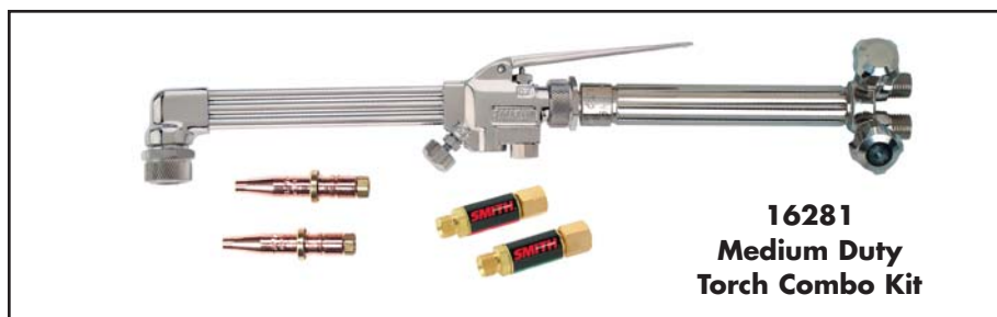
16281 Medium Duty Torch Combo Kit